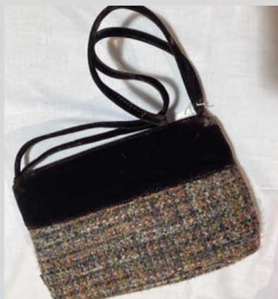
Grey, Green & Rust Tweed w/ Black Velvet & Black Velvet Strap (M) £30