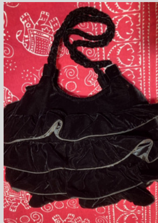
Black Velvet Ruffles (L) £55