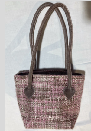
Pink & Grey Tweed w/ Grey Velvet Handle (S) £19