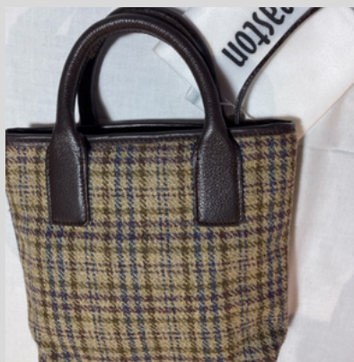
Fawn Tweed w/ Blue & Green Check, Leather Handle (S) £35