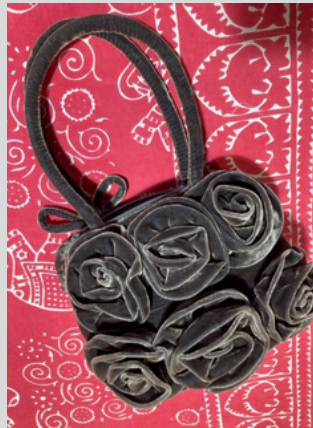
Grey Velvet w/ Roses (S) £39