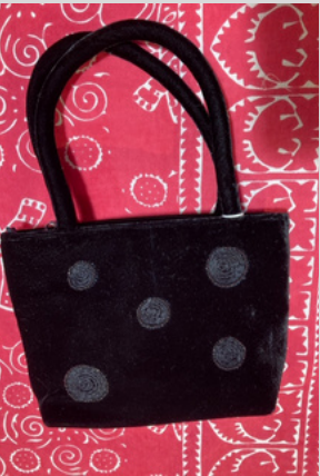
Black Velvet w/ Embroidered Spots (S) £19