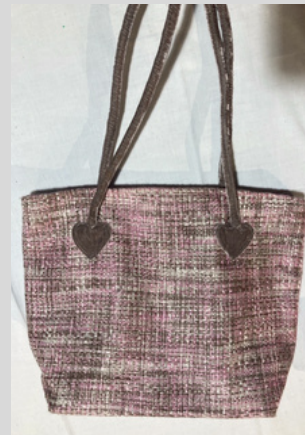
Pink & Grey Tweed w/ Grey Velvet Handle (L) £29