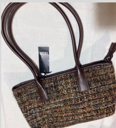
Autumn Tweed w/ Brown Leather Handles (M) £30