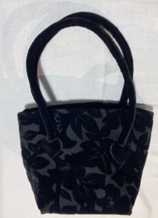
Black Velvet (S) £19