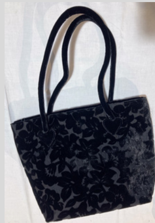
Black Velvet (L) £29