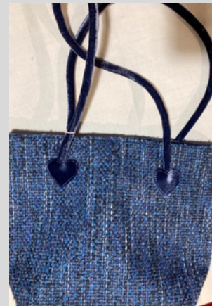
Blue Tweed w/ Navy Velvet Handle (L) £29