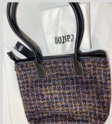
Purple & Ochre Tweed w/ Black Leather Handles (L) £40