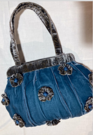
Blue and Grey Velvet Bag w/ Roses (M) £39