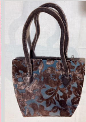
Duck Egg Blue and Grey Velvet (S) £19