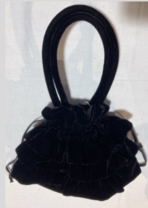
Black Velvet Ruffle w/ Drawstring (M) £32