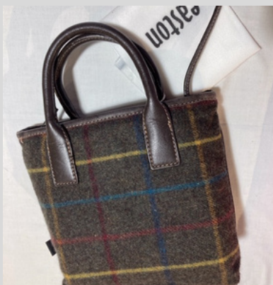
Grey Tweed w/ Yellow, Blue & Red Stripes, Leather Handle (S) £35