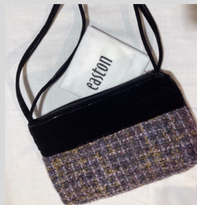
Heather & Ochre Tweed w/ black Velvet & Black Velvet Strap (M) £30