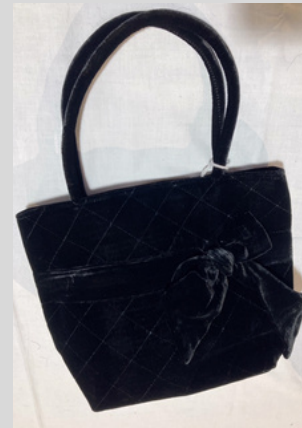
Black Velvet w/ Bow (M) £25